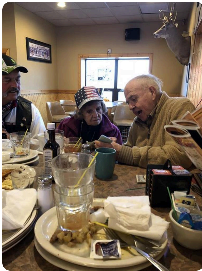
Breakfast at Jaspers