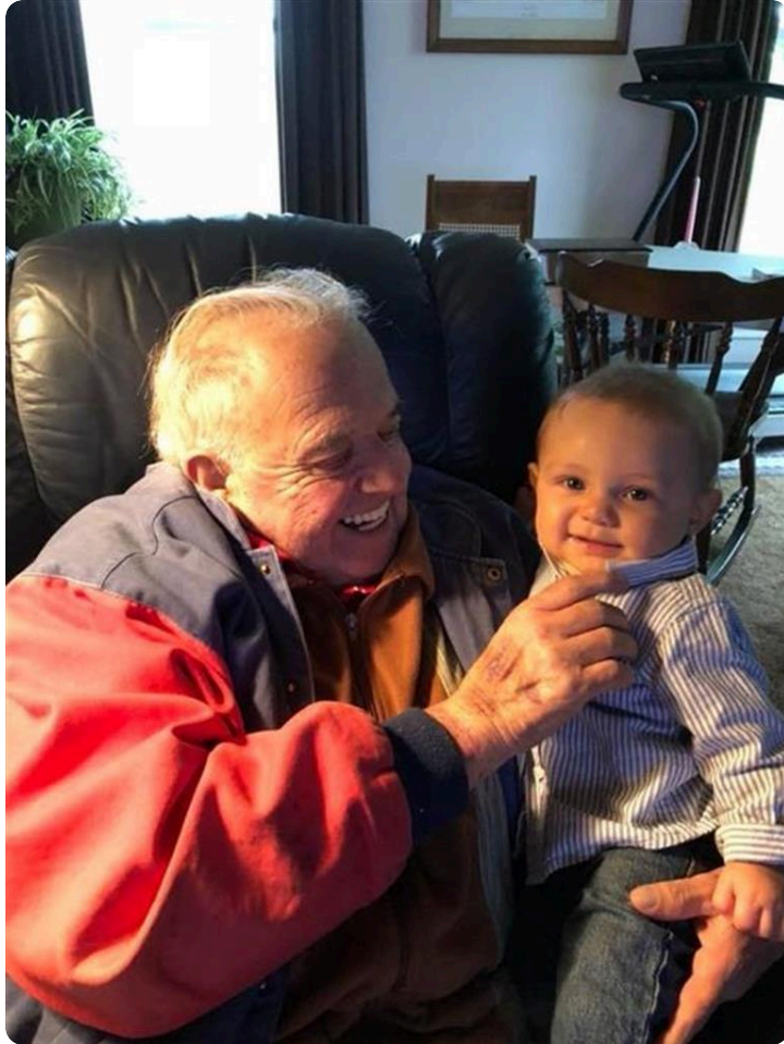
Smiles all around