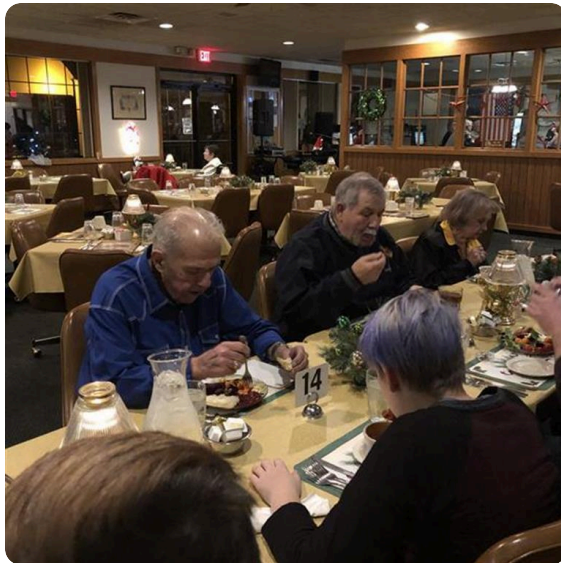
Xmas at the Elks 2019